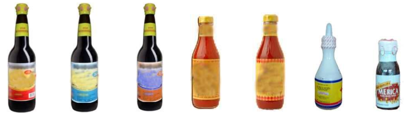
Soy Sauce (Sweet)

With its core products in soy, chili, and tomato sauces; the Company is gradually extending the varieties to other product lines. Other than sauce product lines, it is now also manufacturing packaged pepper and vinegar.